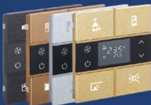
Switches and Thermostats