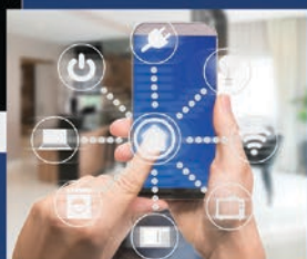
Visualization and Control Devices