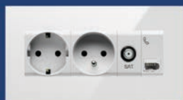
Sockets and Frames