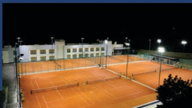
Outdoor Field Lighting

We illuminate sports fields in accordance with international standards and the rules of federations and organizations.